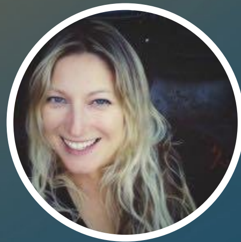
Amy Talbot Regional Water Authority