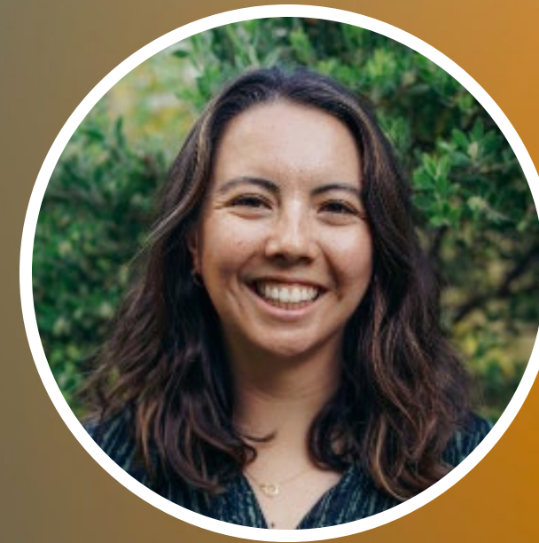
Geneva Gondak East Bay Municipal Utility District