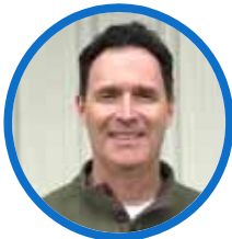
Moderated by: William Granger City of Sacramento