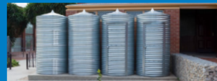
5. Rain Tanks and Cisterns