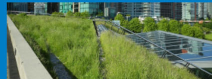
4. Green Roofs